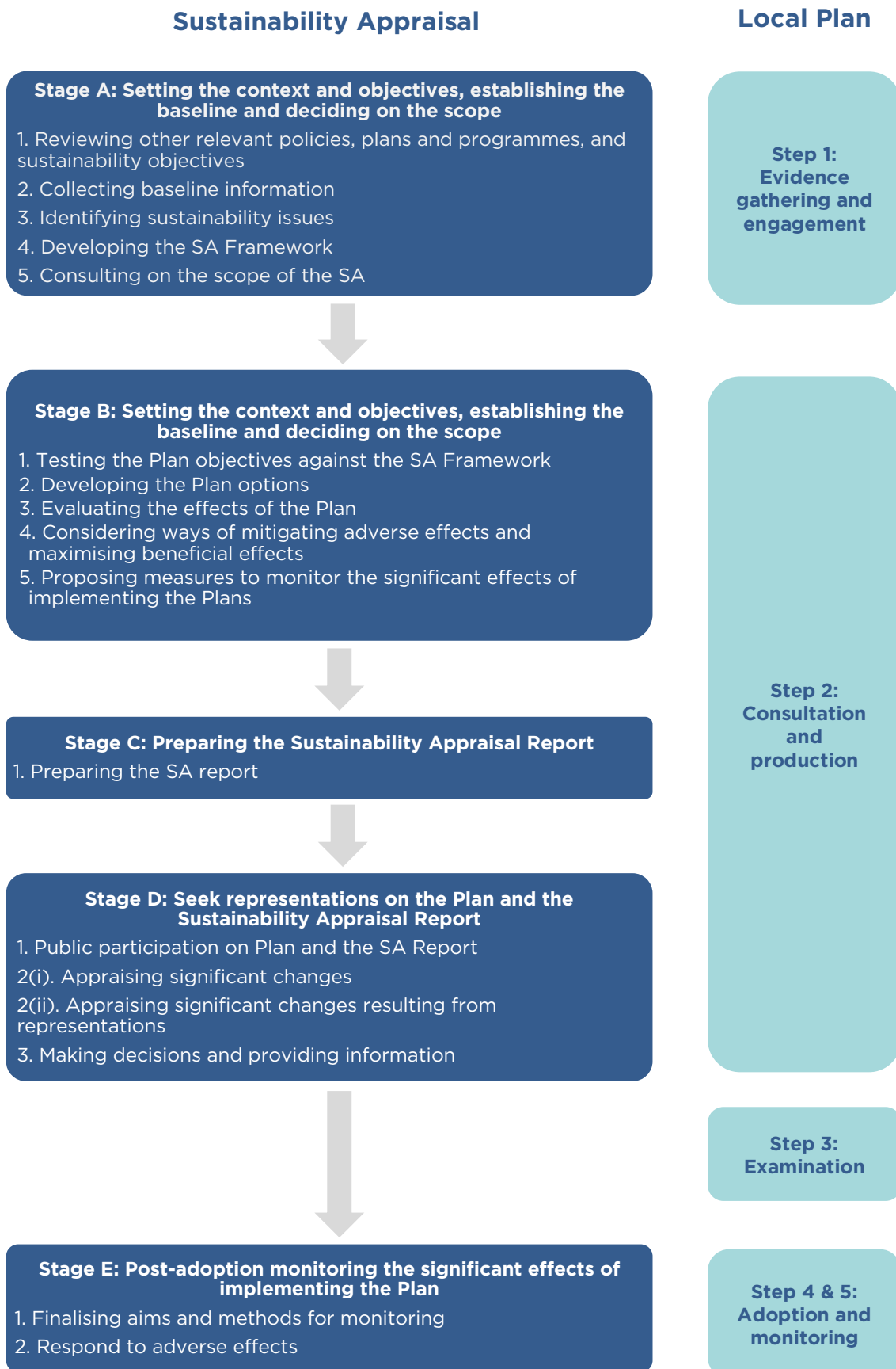
Figure 1.2: Sustainability Appraisal process